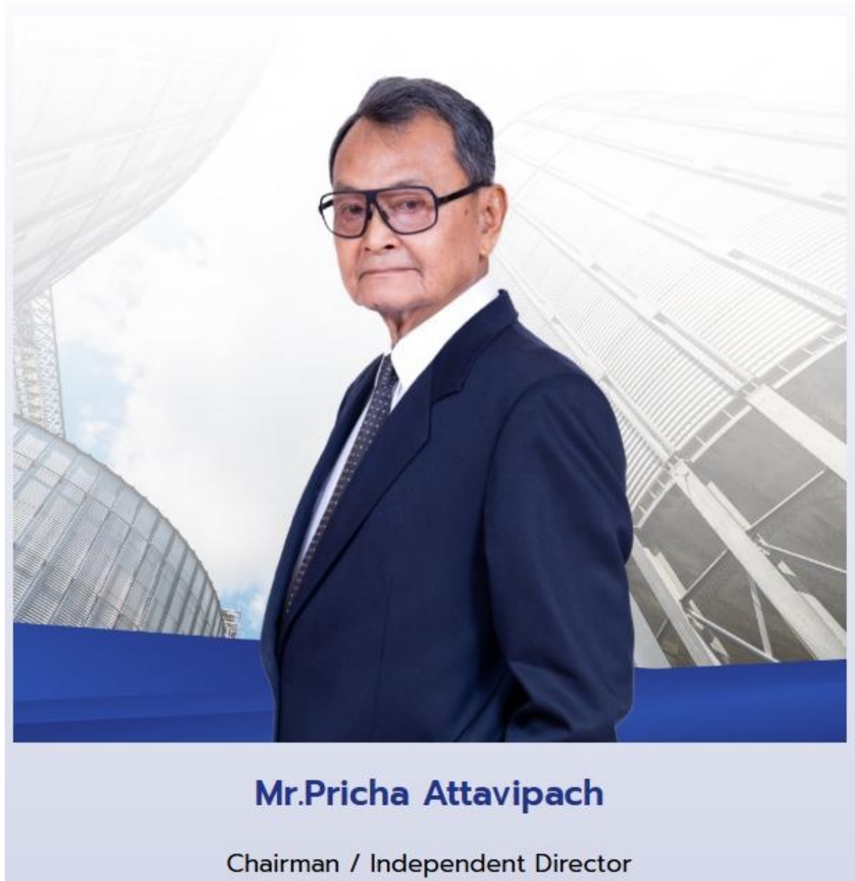
Image Message from the chairman

sectors to ensure that our company moves forward steadily amidst global changes and can grow sustainably with society and the economy.